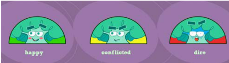
Fig. 4. Tree global environment feedback states (tree colour and facial expression)