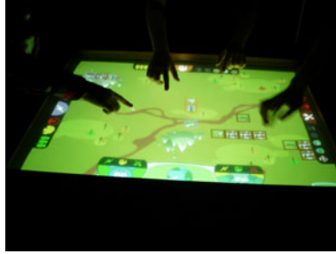
Fig. 1. Sustainability game on our custom tabletop

There are three distinct roles that players can take: food, shelter, or energy supply. Each role has an individual toolbar oriented to each of the three sides of the table (Figure 2). The goal of the game is to support the population living in the area without having a catastrophically negative effect on the environment. Players must decide what kinds of food, shelter, or energy producing facilities to construct, and attempts to achieve balance in terms of the population support: neither wasting resources nor failing to provide for the population's needs.