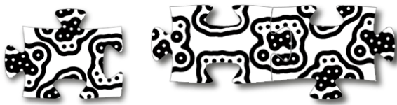
Figure 1. Unique markers are distributed across pieces.

In this paper, we provide the design goals for our original EventTable prototype followed by a description of our system implementation and three variations of distributed marker tracking. We illustrate our technique by describing three examples of object tracking designs which utilize distributed markers implemented on EventTable. Two of these examples use our distributed marker technique alongside traditional tracking of individual objects tagged with whole markers. We then discuss the advantages of this technique in terms of technical reliability and prototyping flexibility. We conclude with new directions for tabletop research based on an event-based approach.