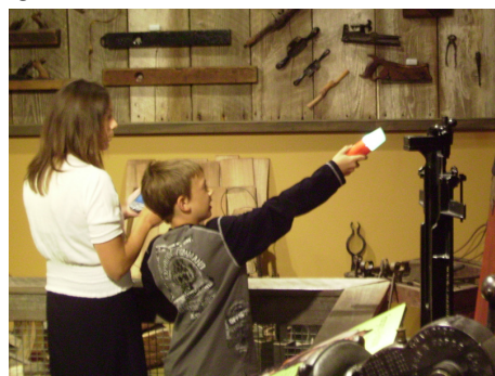
Figure 1. Mother and her son with Kurio.

In this paper, we focus on a description and discussion of the system with particular emphasis on the tangible user interface within a hybrid system and evaluation of the design goals. We will detail technical details, user