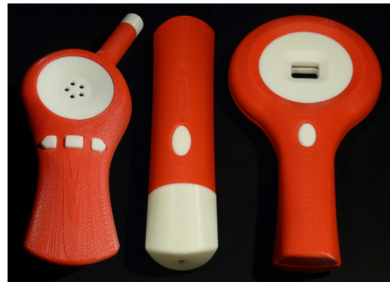
Figure 2. Tangibles from left to right: listener , pointer , reader .

Kurio is a hybrid system comprised of a set of tangible computing devices, a PDA, and a tabletop display. We used