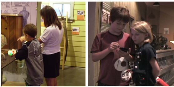
Figure 4. Mother and her son “pause” to discuss a challenge (left); boy explaining to his sister what she needs in order to complete a challenge (right).

synthesis of data points that include the above plus observations based on video and audio recordings, and the follow-up self-administered interviews.